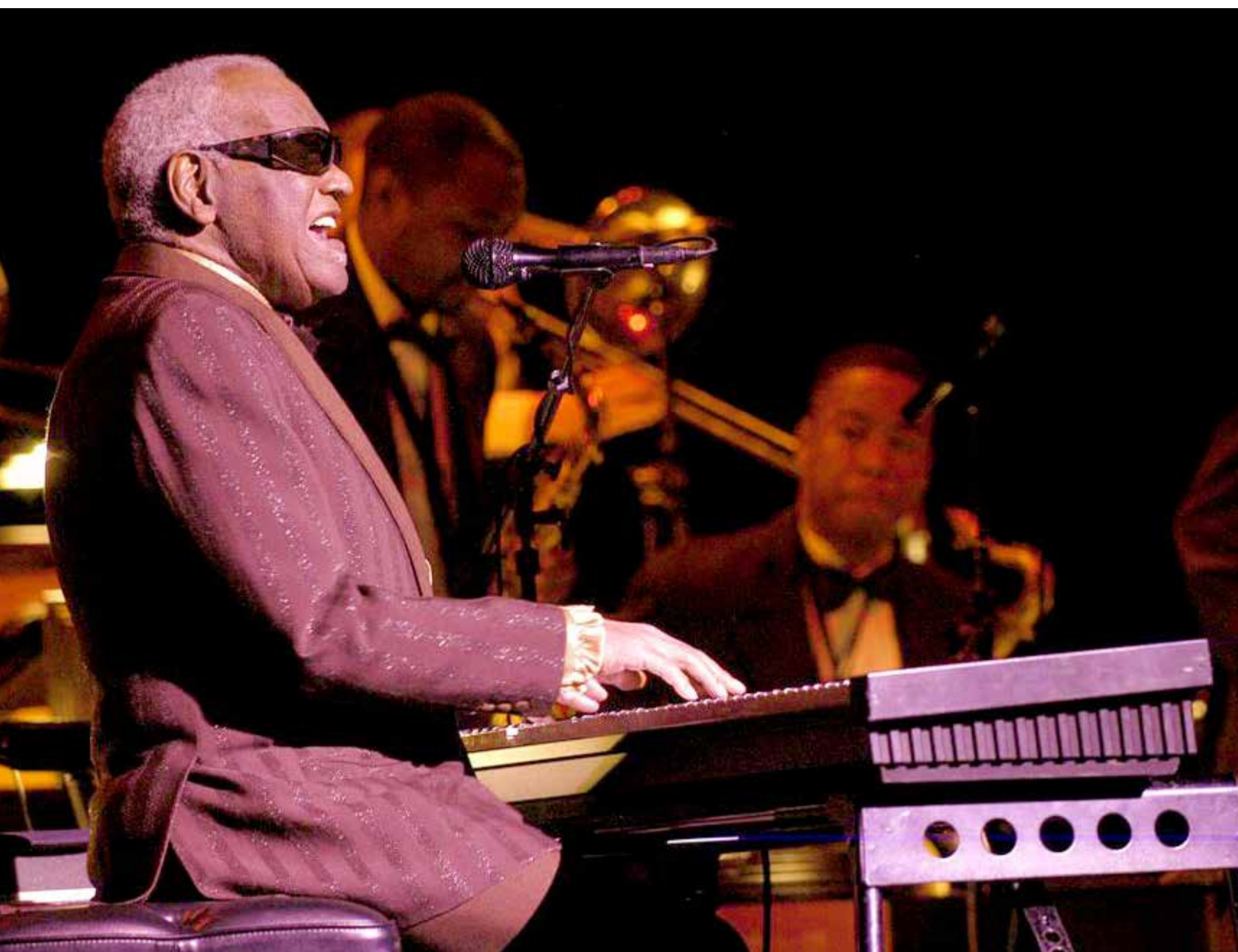
Ray Charles, Montreal International Jazz Festival, 2003.

one man was a jeweler; another girl was a seamstress, and so on. He had declared most strongly, however, that the parents should not shelter their blind children, but to develop their attitude positively, enabling them to lead a normal life. They were not to nurture their self-pity but encourage them to fight for what they wished to become. He had stated: