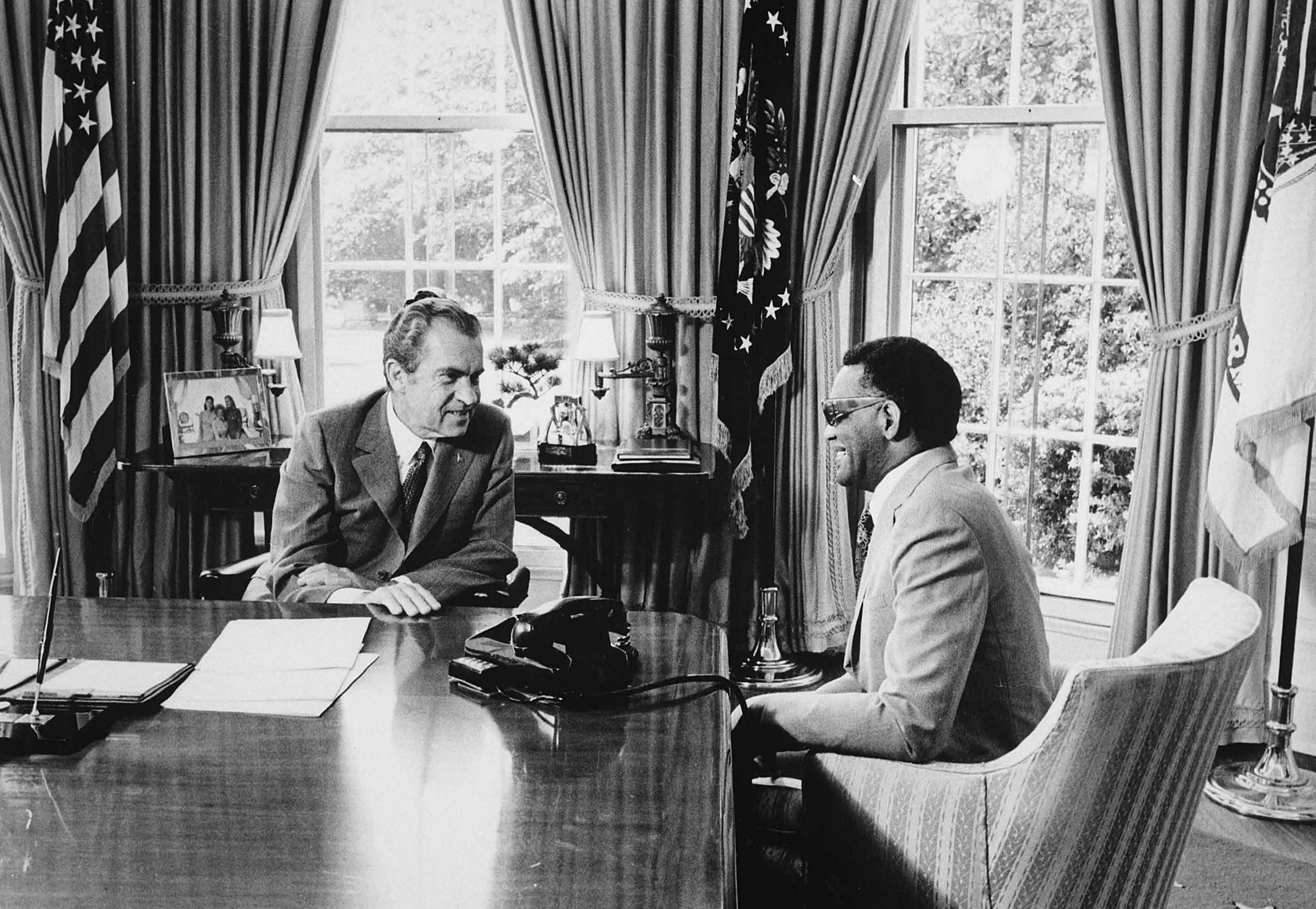
Former President Richard Nixon meeting with Ray Charles in the Oval Office, 1972.

the white people are not aware what the black man is like and vice versa. So there should be more dialogue and more meetings, gatherings where people could get together and talk, and get to enjoy each other. There are a lot of tales about this person being this way, that way... There's no such thing, people are just people. If people communicate a little more, work together more; go to school together so they get to know each other better... This is the way to do it, because if the black man in this country starts a war it's impossible for him to win a violent type of thing.