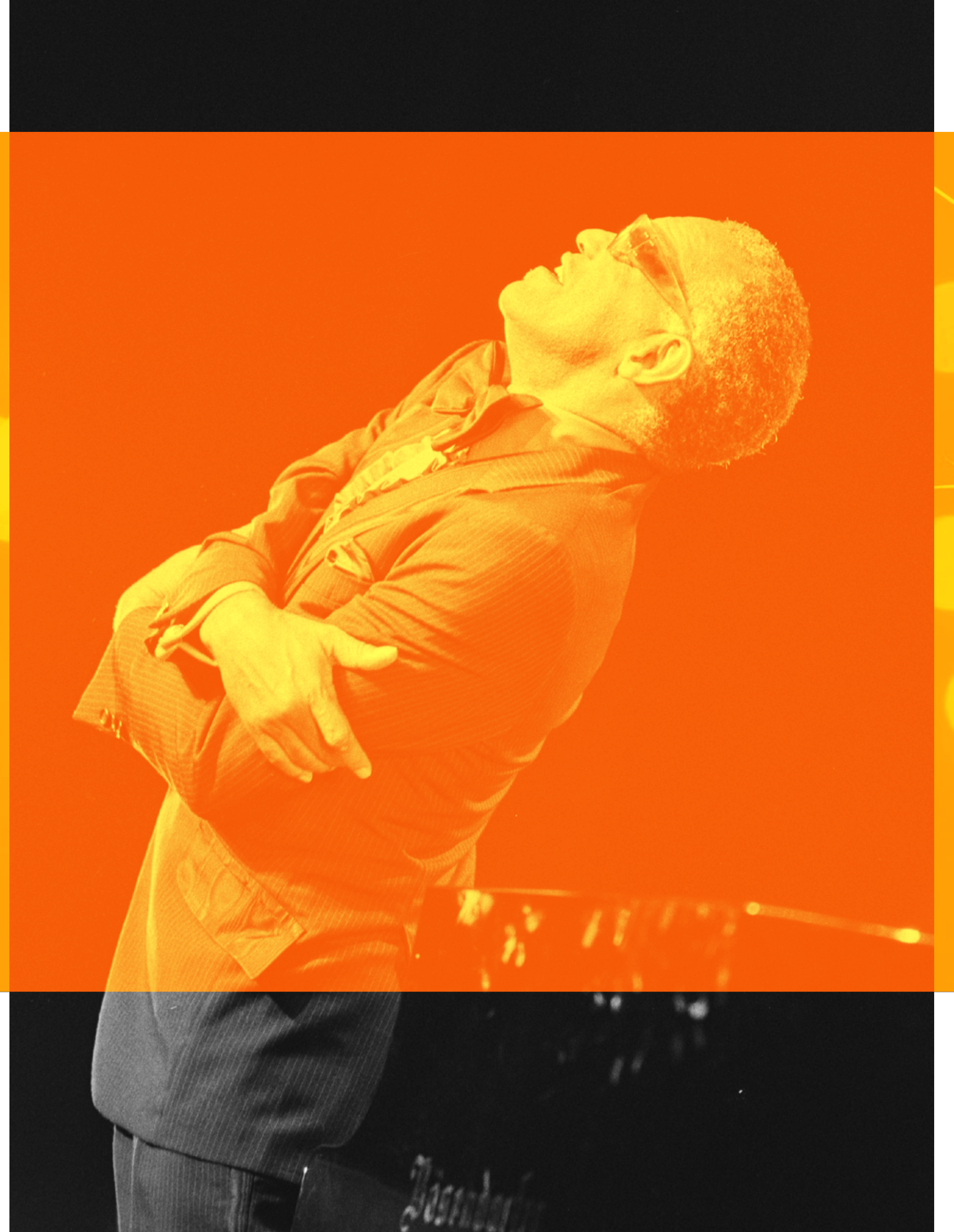
Ray Charles, North Sea Jazz Festival, The Hague, 1983.

When it was time to start taping, Ray had grabbed my recorder with curiosity and, examining it with his fingertips, had told me