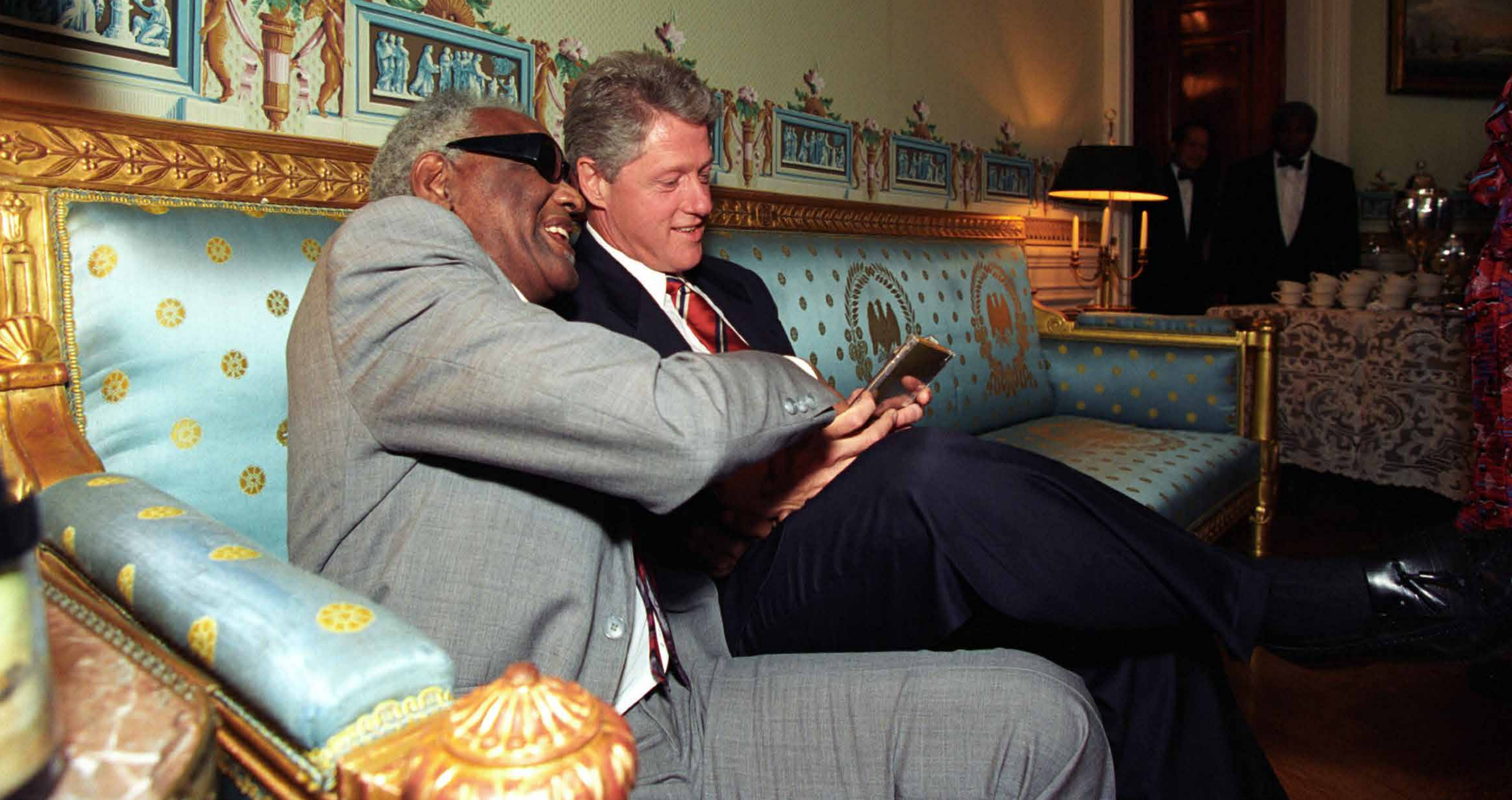
Former President Bill Clinton sits with Ray Charles in the Blue Room prior to the ceremony to honor the 1993 National Medal of Arts Award recipients.

So today I am grateful that I know both sides of life. I know how to live with something but I also know how to live with nothing. You can feel for people who are suffering because you know what it is to be cold, you know what it is to be hungry, what it is to be ragged, you know what it is when people talk down to you, and do things to you to injure your integrity.”